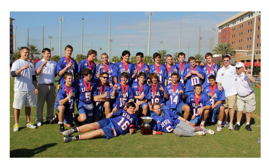
Rochester USA 2012 BROGDEN CUP CHAMPIONS