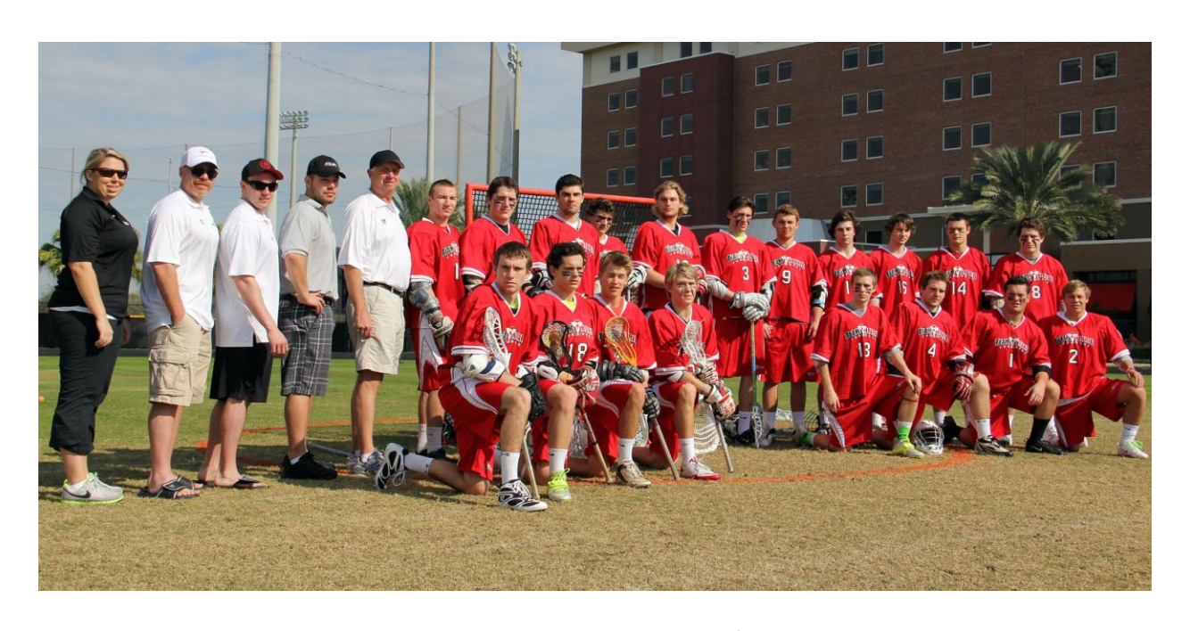
Ontario CANADA Team Photo