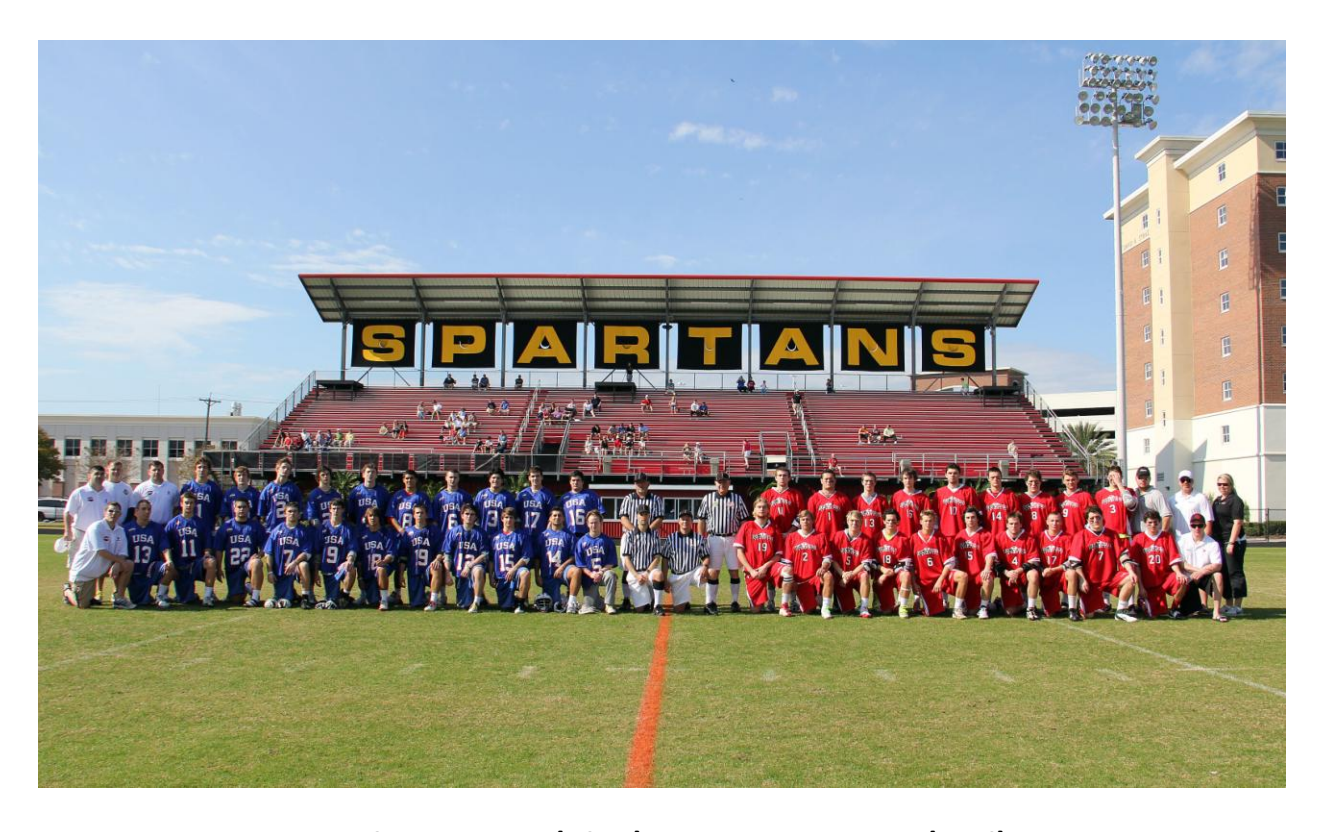
Rochester USA (Blue) Ontario CANADA (Red) UNIVERSITY OF TAMPA